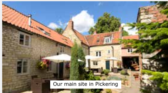
Our main site in Pickering

We are a small holiday cottage business with cottages in Pickering and on the North Yorkshire Moors. Our cottages are a mixture of those we own and operate ourselves and others that we act as an agency. The common link is that all the cottages have an emphasis on quality, service and a real home from home feel.